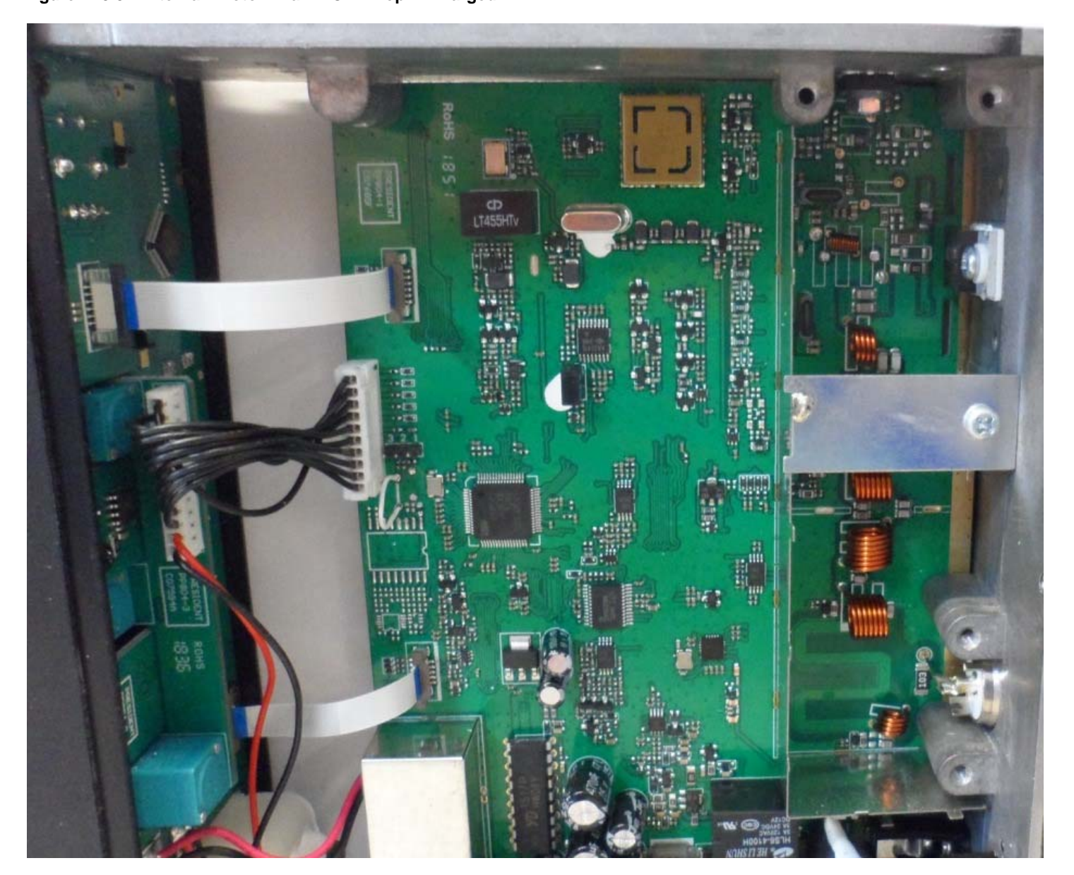
Figure E19.3 - Internal Photo - Main PCB - Top - Enlarged