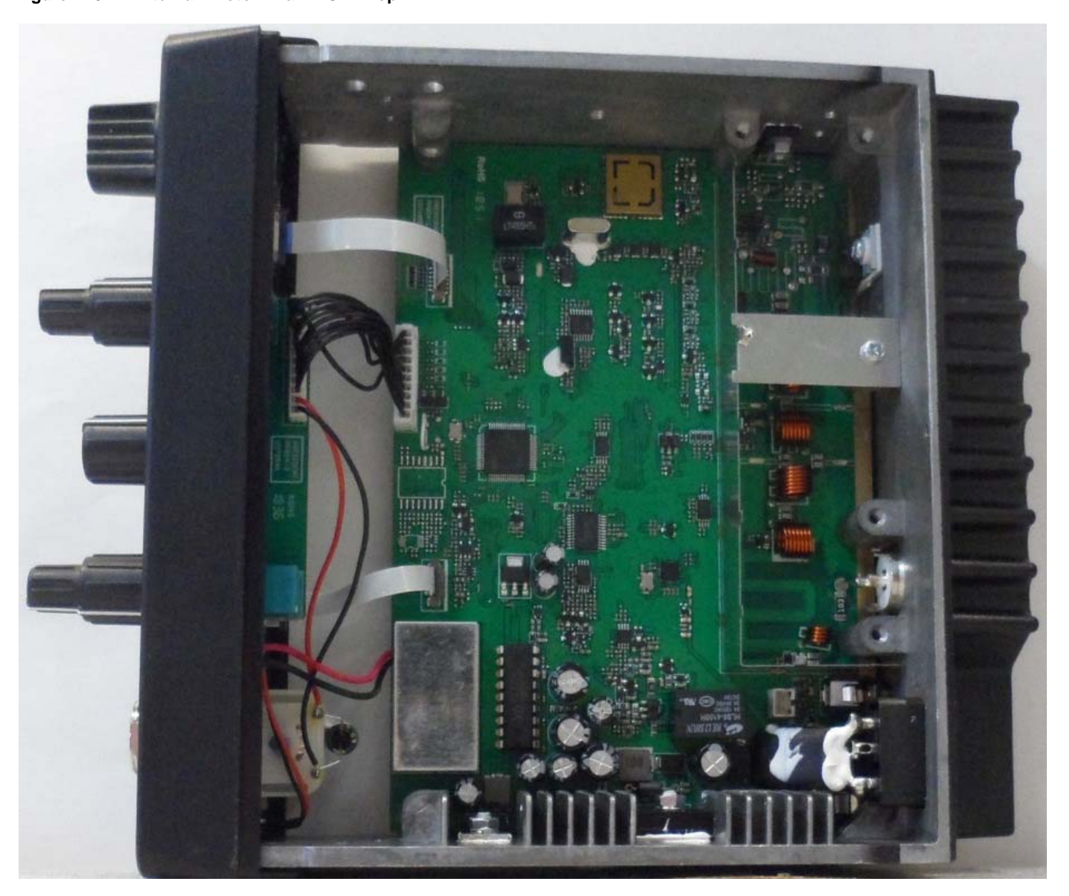
Figure E19.2 - Internal Photo - Main PCB - Top