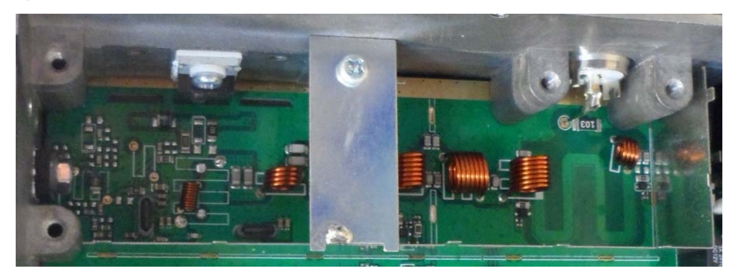
Figure E19.4 - Internal Photo - Main PCB - RF Section