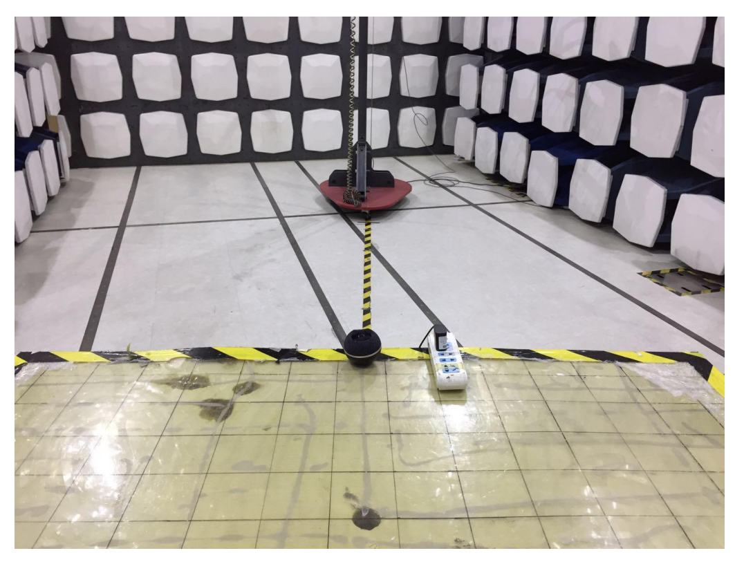
Front View of Radiated Emissions up to 1GHz