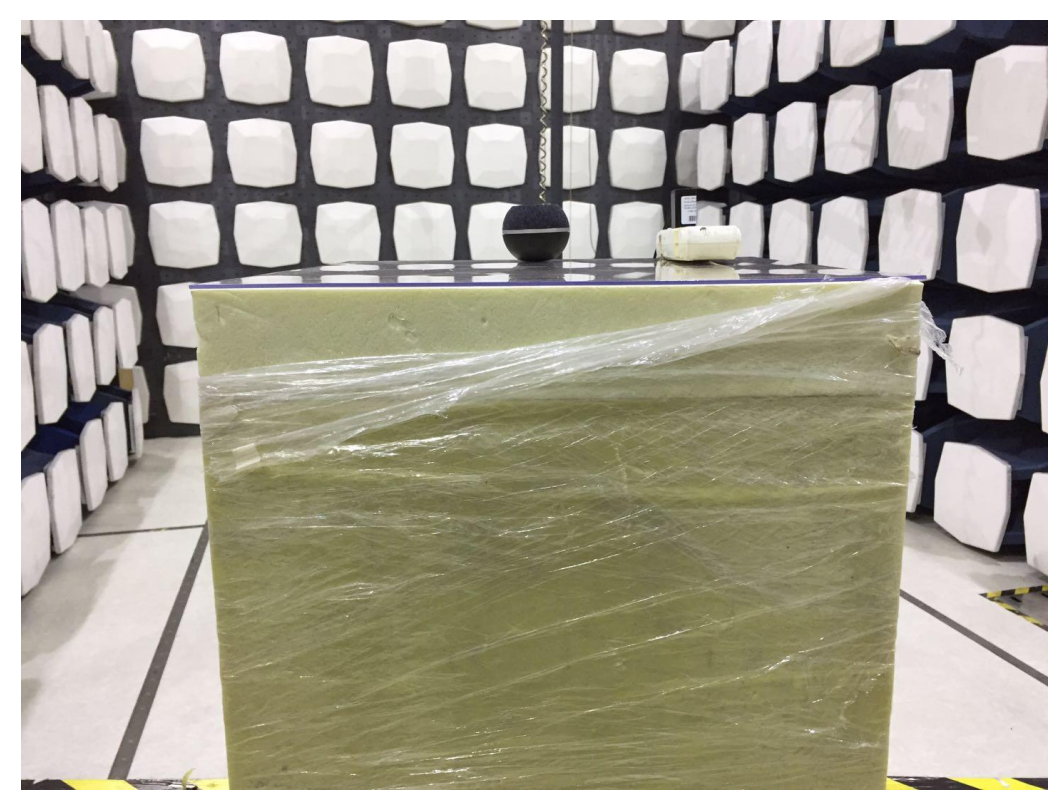
Front View of Radiated Emissions above 1GHz