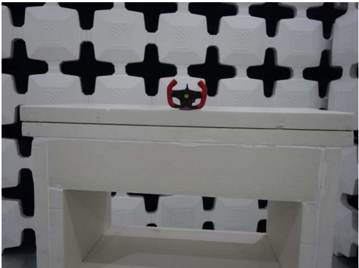
Above to 1GHz (The EuT placed at the center of the turntable)