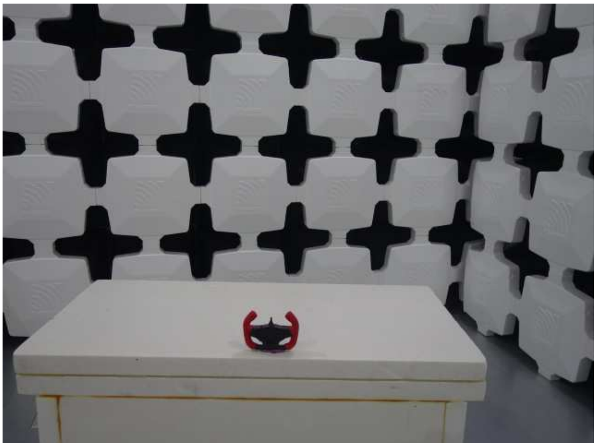
Up to 1GHz (The EuT placed at the center of the turntable)