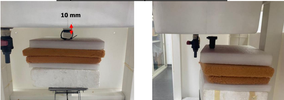
Fig.4 Front side of EUT to flat phantom

Unless otherwise stated the results shown in this test report refer only to the sample(s) tested and such sample(s) are retained for 90 days only.