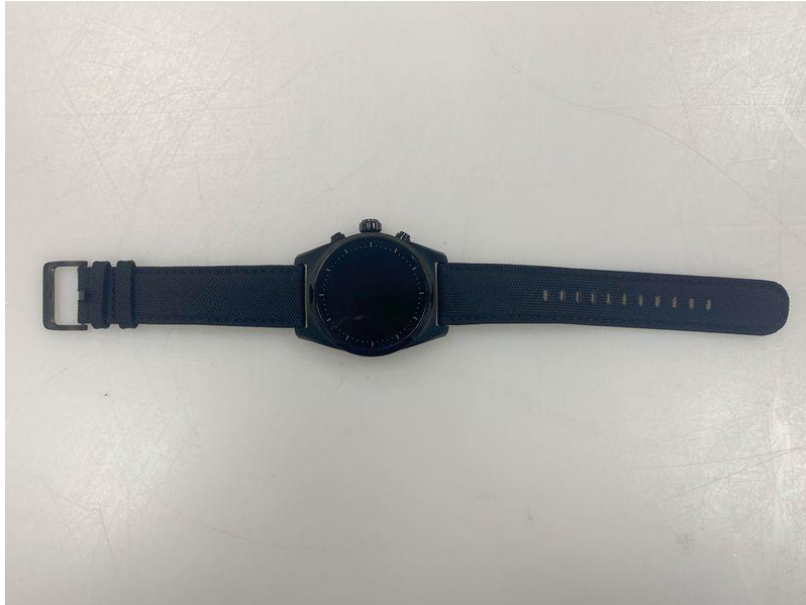
Fig.5 Front view of EUT