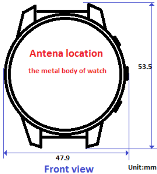
Fig.7 Antenna location (front view)