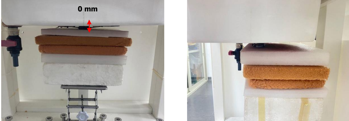
Fig.3 Back side of EUT to flat phantom