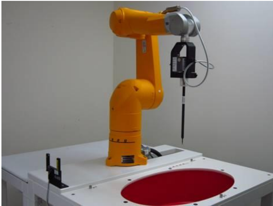
Fig.1 Photograph of the SAR measurement system

Unless otherwise stated the results shown in this test report refer only to the sample(s) tested and such sample(s) are retained for 90 days only. 除非另有說明，此報告結果僅對測試之樣品負責，同時此樣品僅保留90天。本報告未經本公司書面許可，不可部份複製。