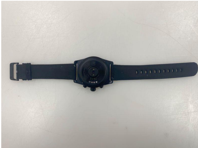
Fig.6 Back view of EUT

Unless otherwise stated the results shown in this test report refer only to the sample(s) tested and such sample(s) are retained for 90 days only.