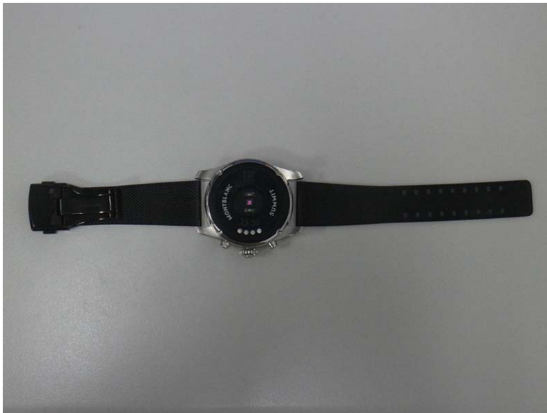
Fig.5 Back view of EUT

Unless otherwise stated the results shown in this test report refer only to the sample(s) tested and such sample(s) are retained for 90 days only. 除非另有說明，此報告結果僅對測試之樣品負責，同時此樣品僅保留90天。本報告未經本公司書面許可，不可部份複製。