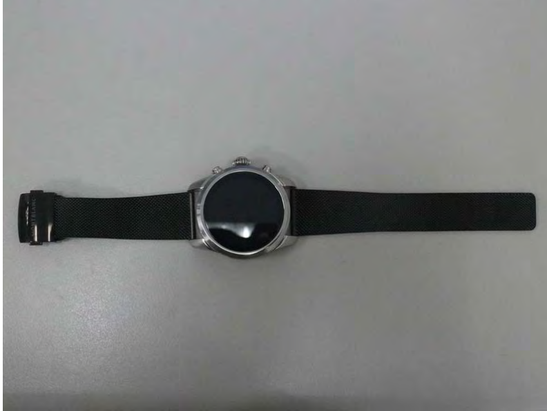
Fig.4 Front view of EUT