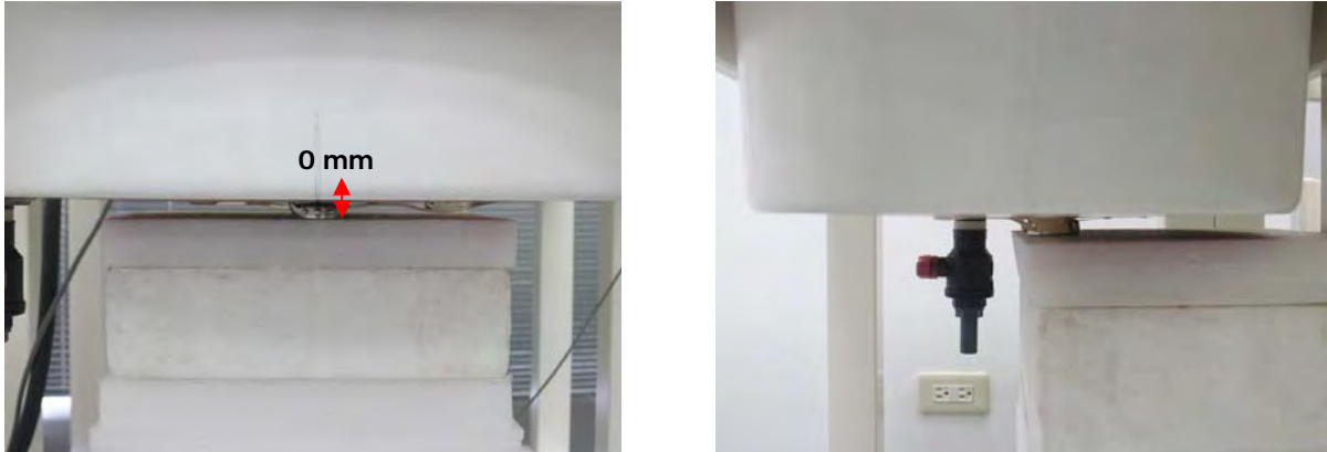
Fig.3 EUT Back side to flat phantom

Unless otherwise stated the results shown in this test report refer only to the sample(s) tested and such sample(s) are retained for 90 days only.