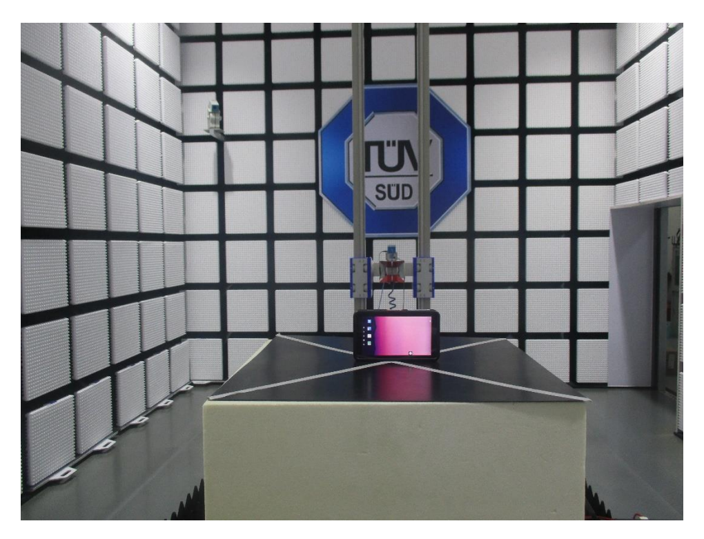
Spurious emission 1GHz – 18GHz