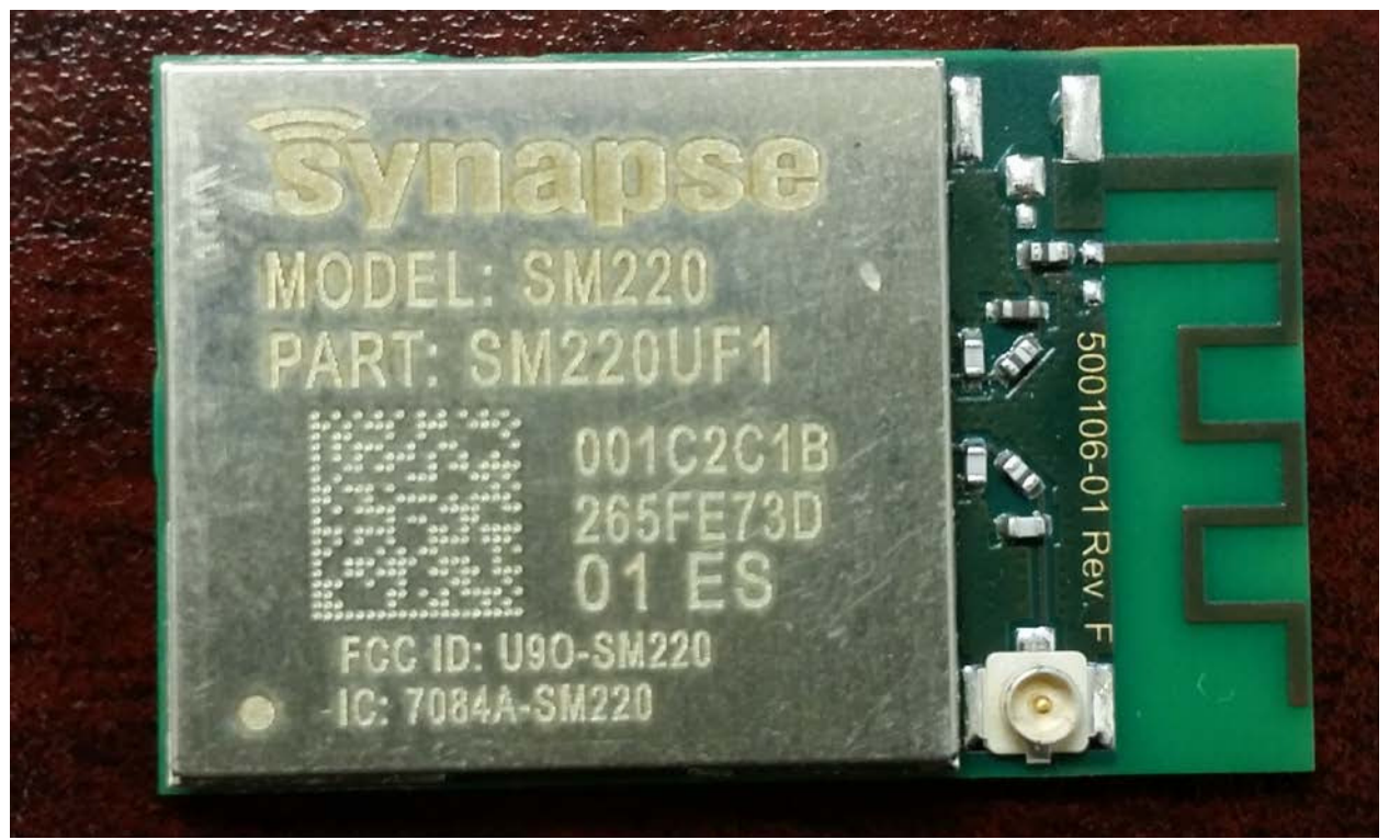
Figure 1: Top View