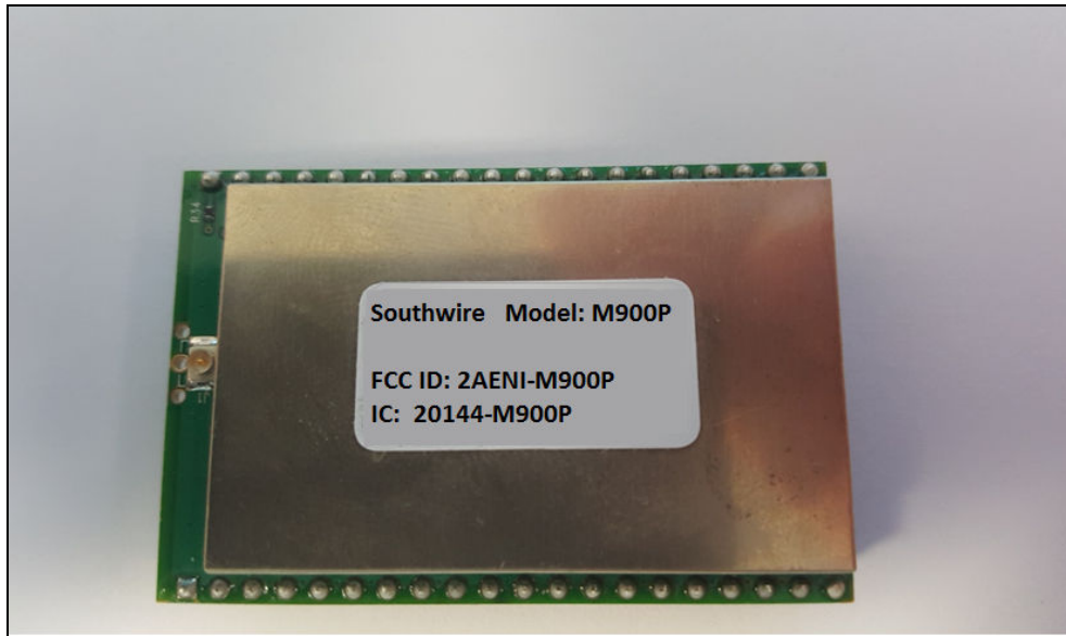
Figure 1: External Photo