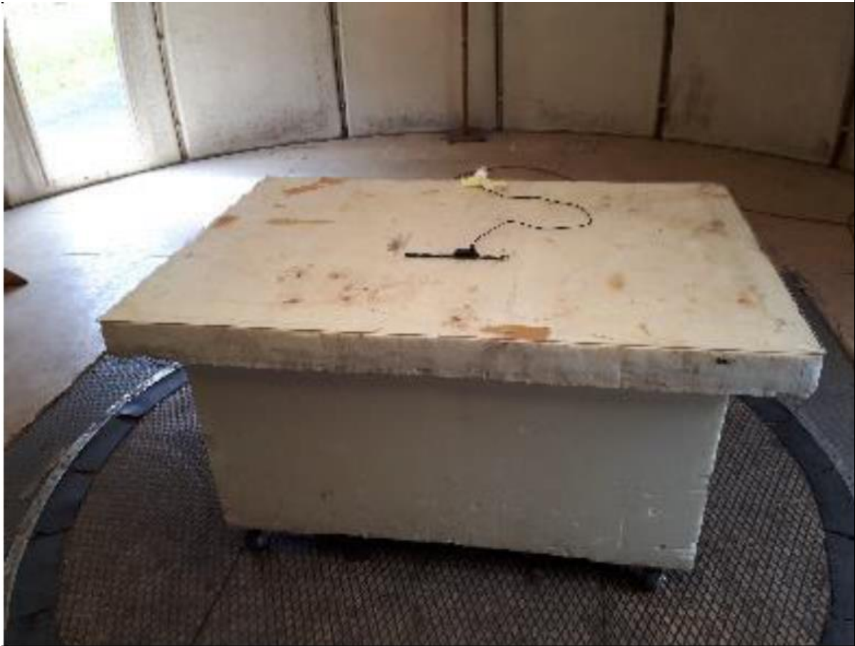
Radiated Emission measurement below 30MHz (2)