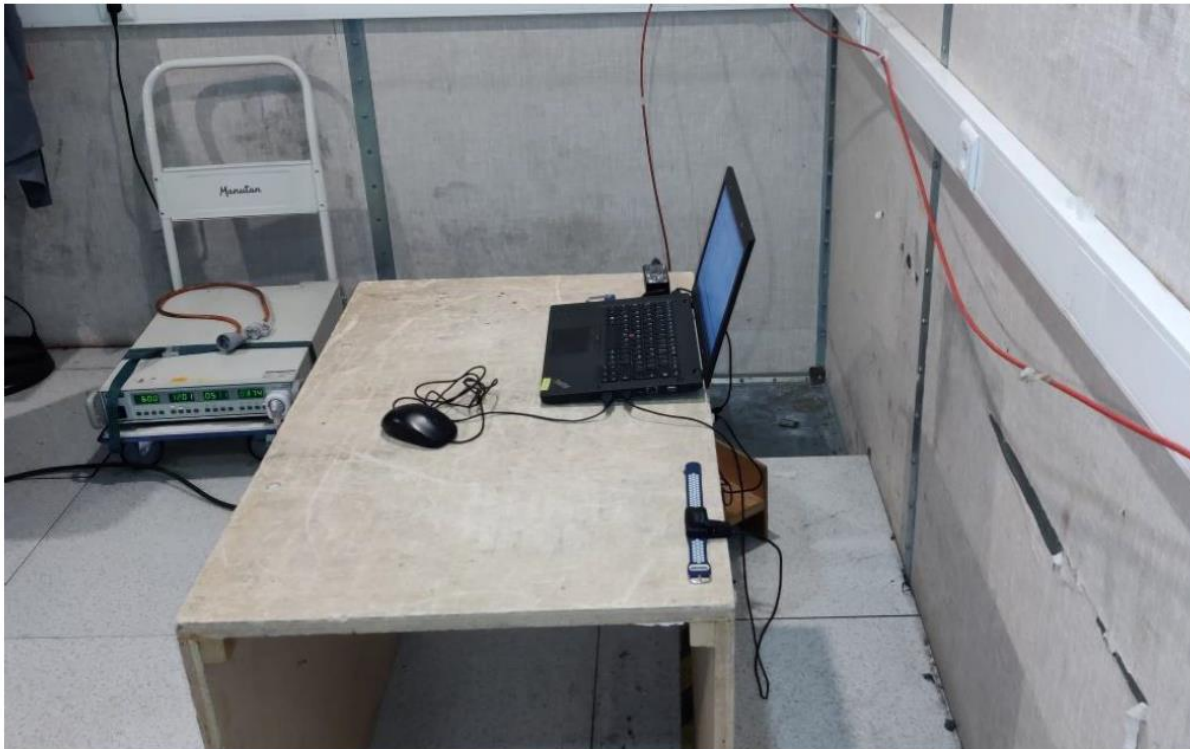
Conducted emission measurement (2)