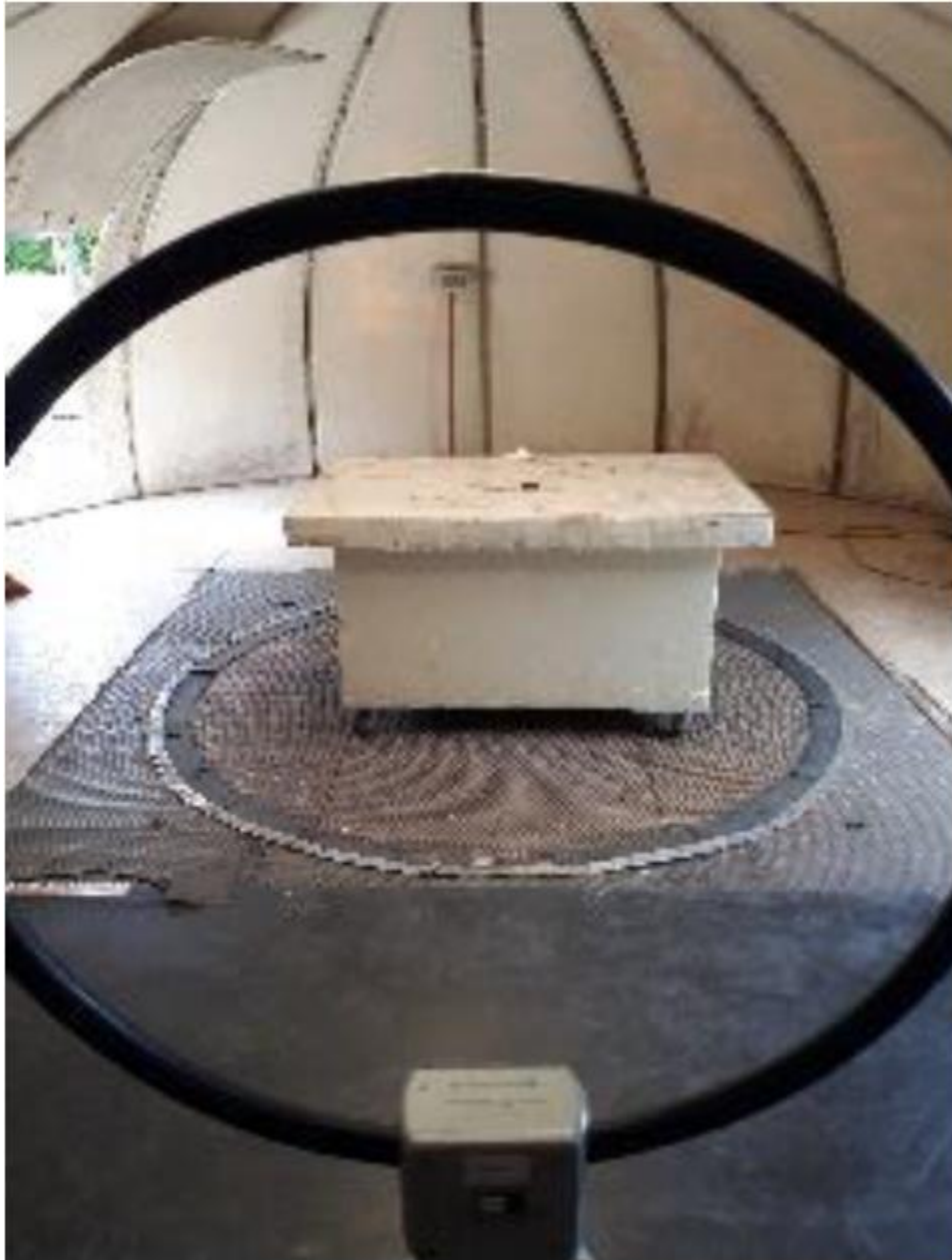
Radiated Emission measurement below 30MHz (1)