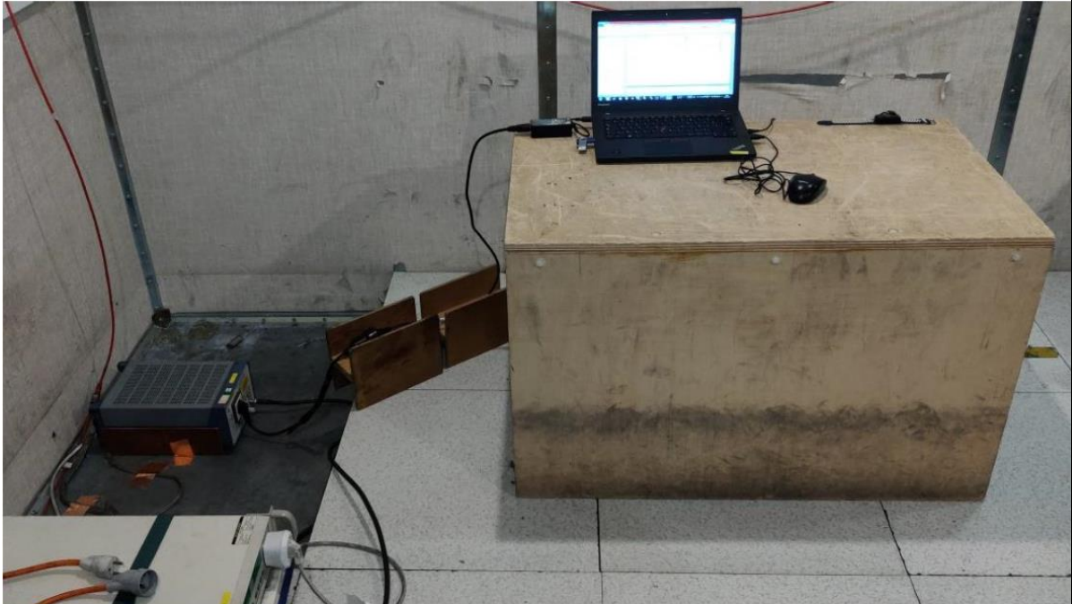
Conducted emission measurement (1)