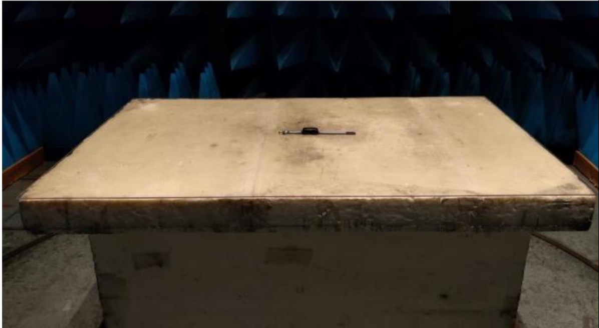
Radiated Emission measurement between 30MHz & 1GHz (1)