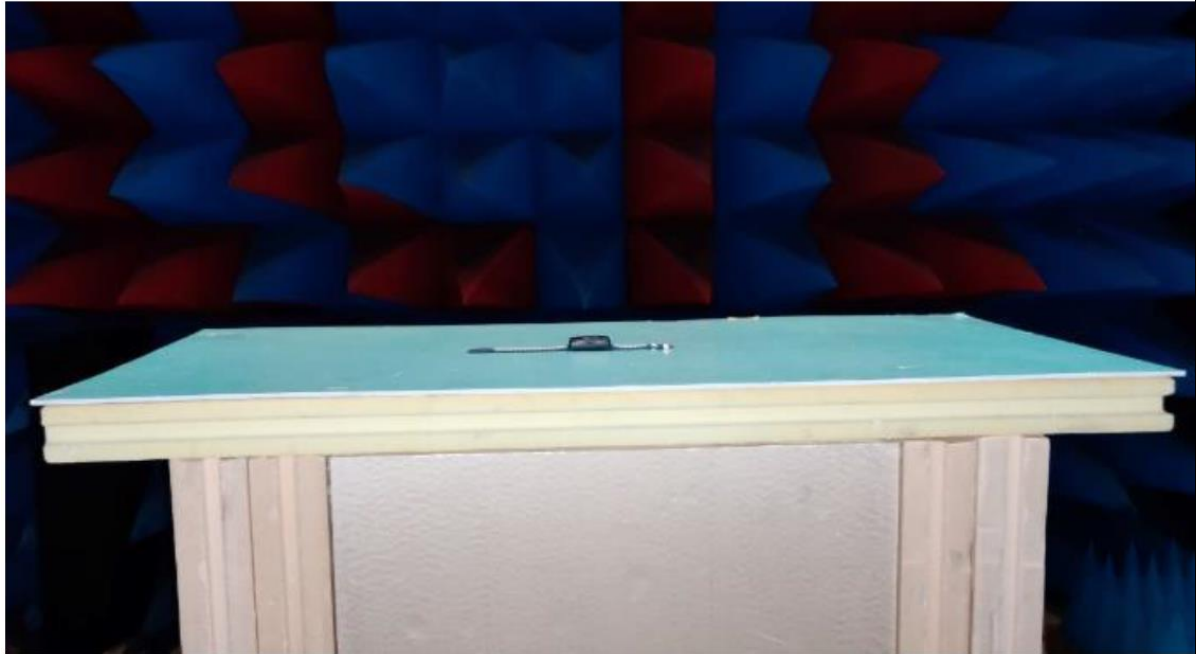
Radiated Emission measurement above 1GHz (1)