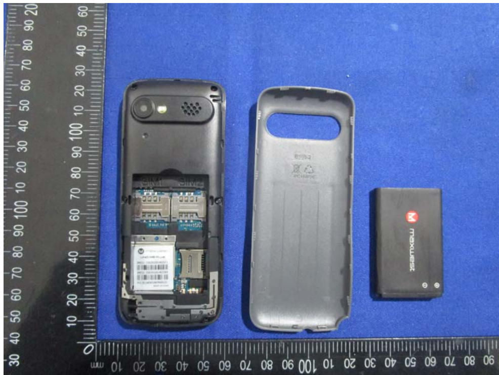
EXHIBIT C - EUT INTERNAL PHOTOGRAPHS