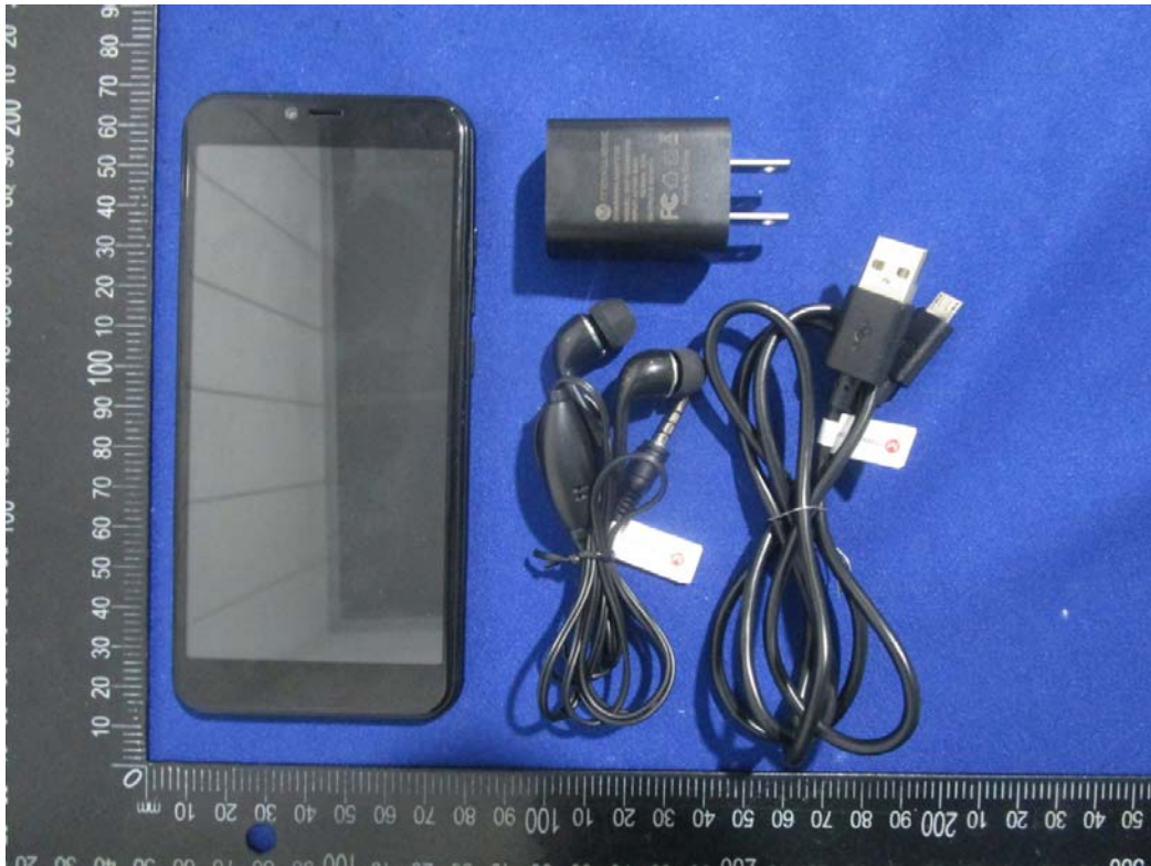
EXHIBIT B - EUT EXTERNAL PHOTOGRAPHS