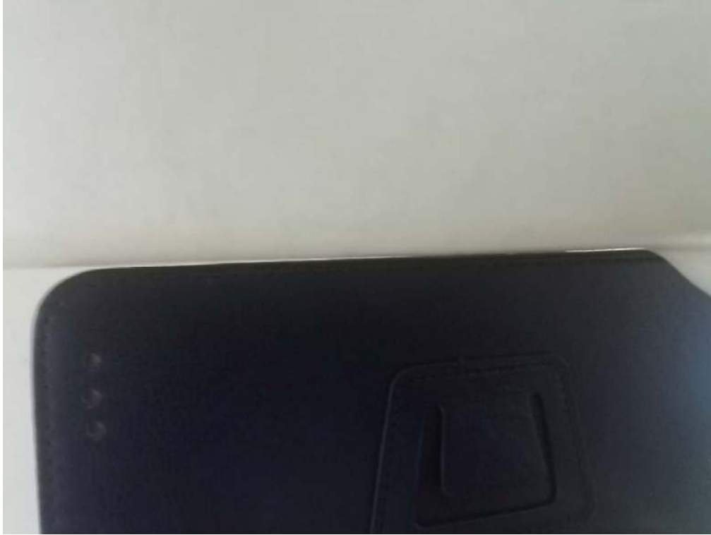
Body-worn Bottom Setup Photo (0mm)