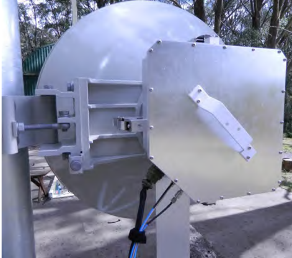
Photo 11 - Rear view of 0.6m dish

CONFIDENTIAL – NOT FOR PUBLIC DISCLOSURE