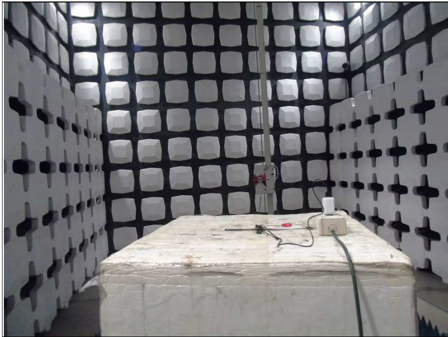
Frequency Range < Above 1GHz >