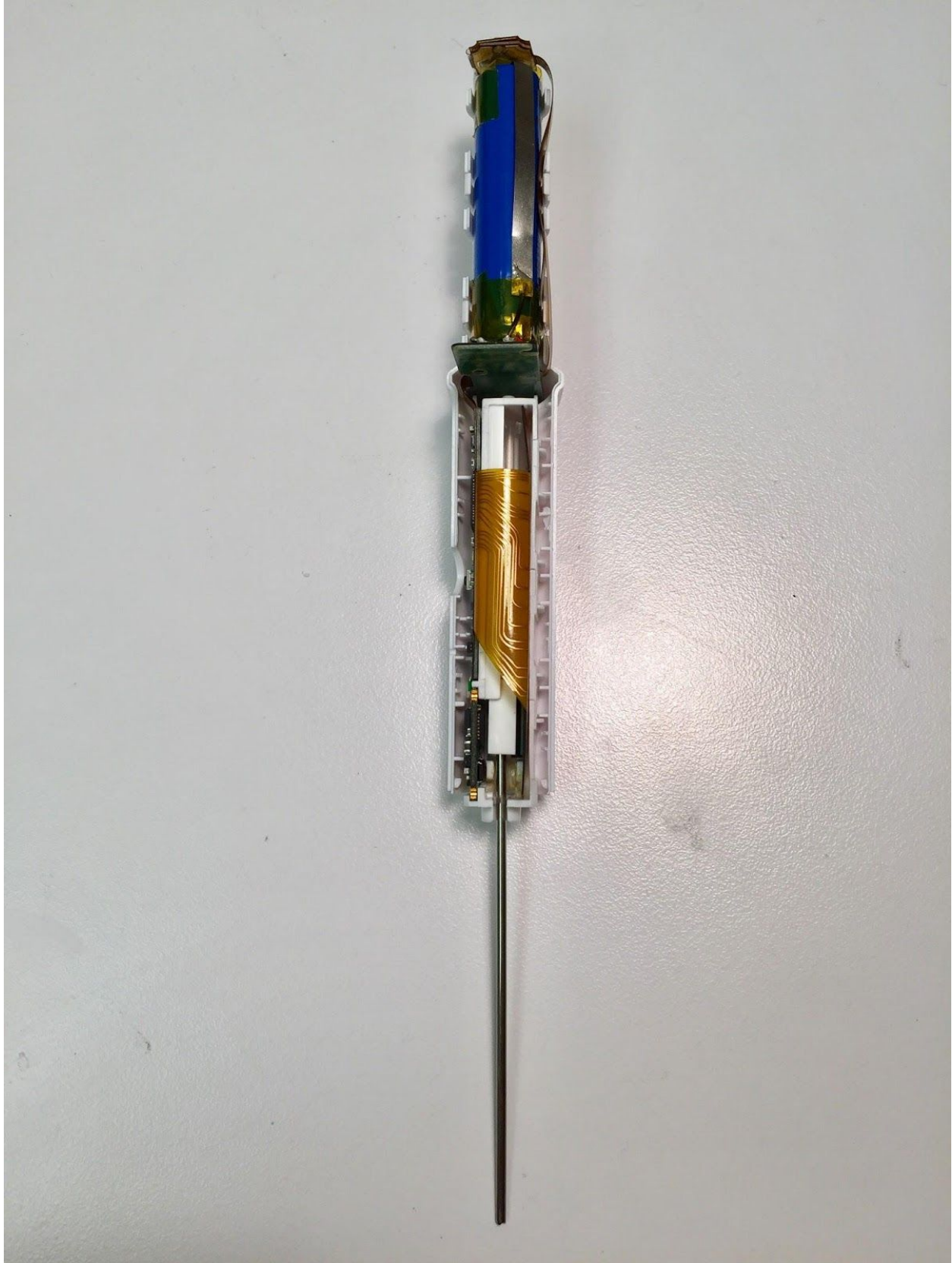
Figure 4: Needle Rotated View