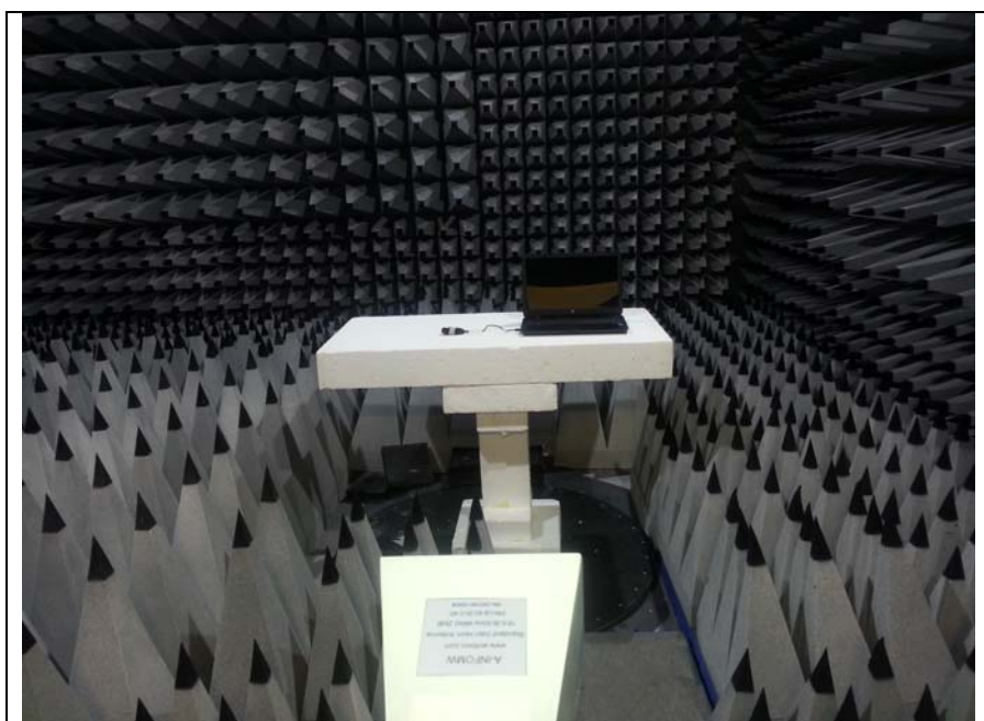
Fig 3 Test setup 18GHz- 26GHz Rad Emission