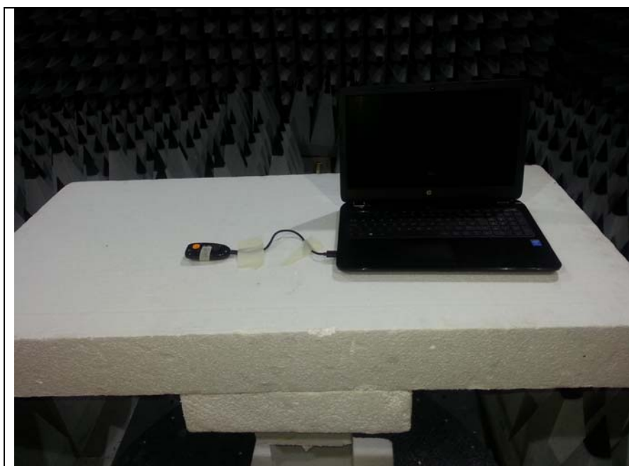
Fig 4 Test setup Rad Emissions