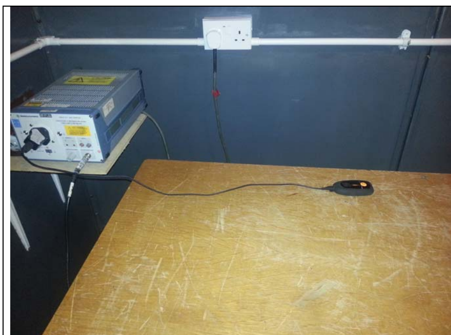
Fig 6 Test setup Conducted Emissions on mains through charger