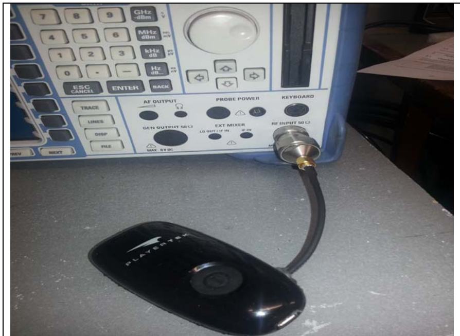
Fig 5 Test setup Conducted measurements