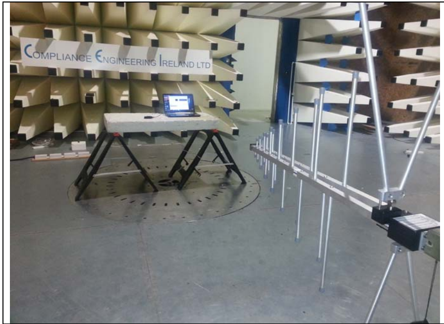
Fig 1 Test setup 30MHz -1GHz Rad Emission