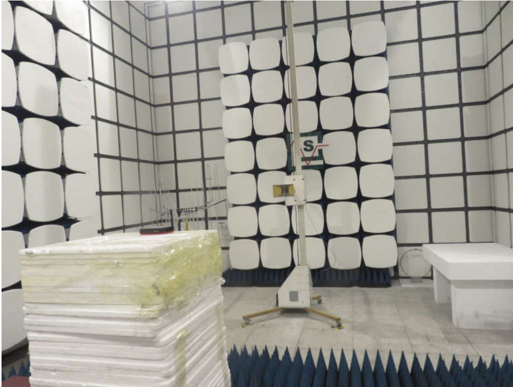
Radiated emission above 1GHz