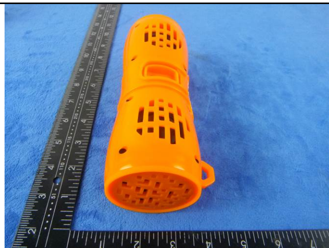
EUT - Top View