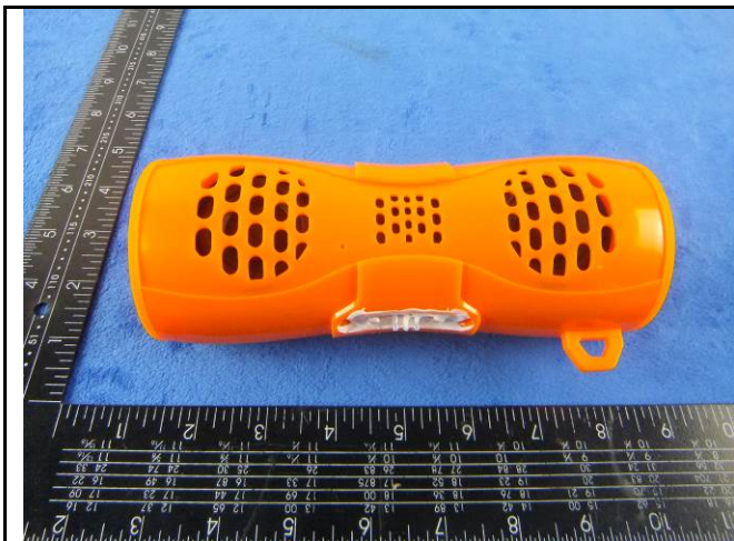
EUT - Right View