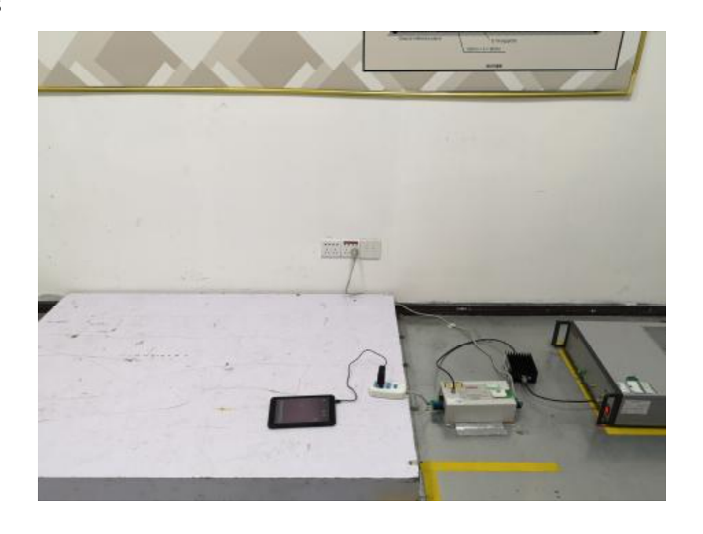
EFT & Dips & Surge