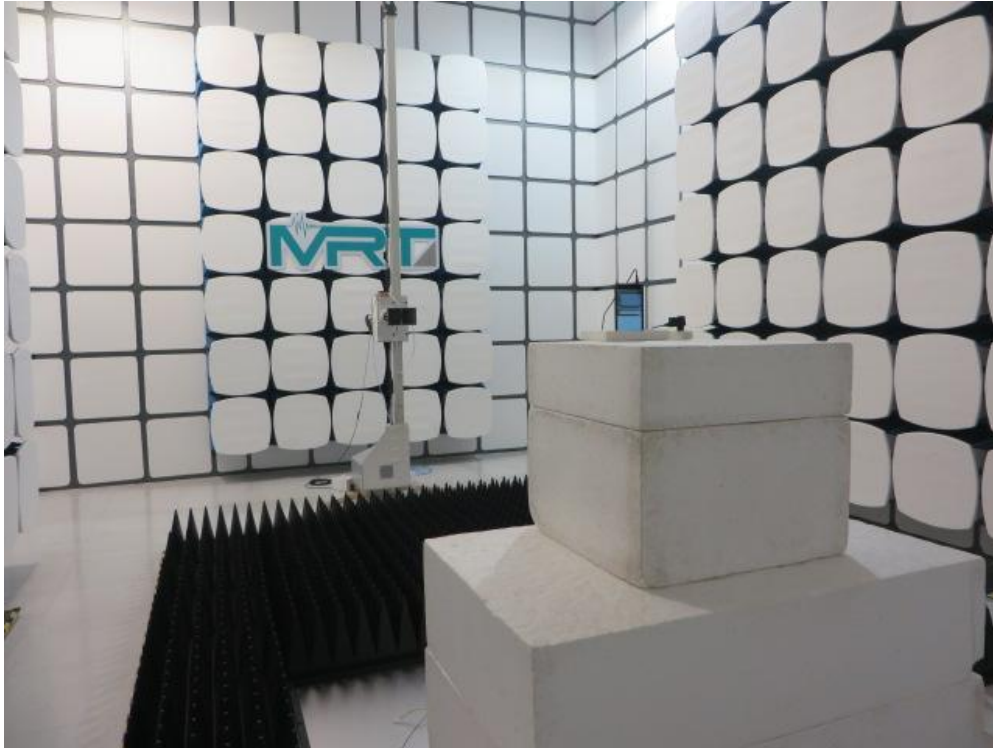
Description: Radiated Emission Test Setup for 18GHz ~ 25GHz