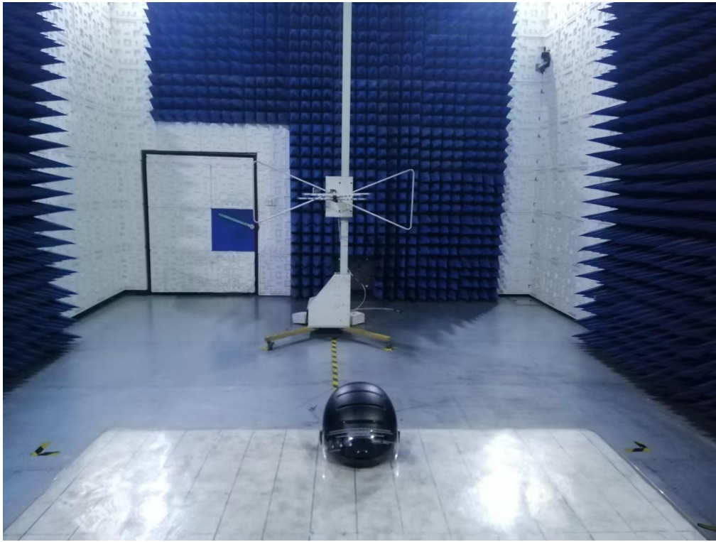
RADIATED EMISSION TEST SETUP ABOVE 1GHz