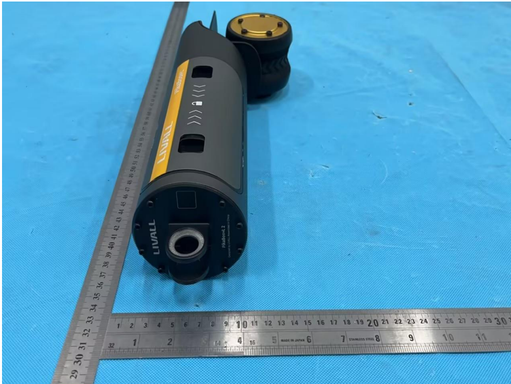
BACK VIEW OF EUT