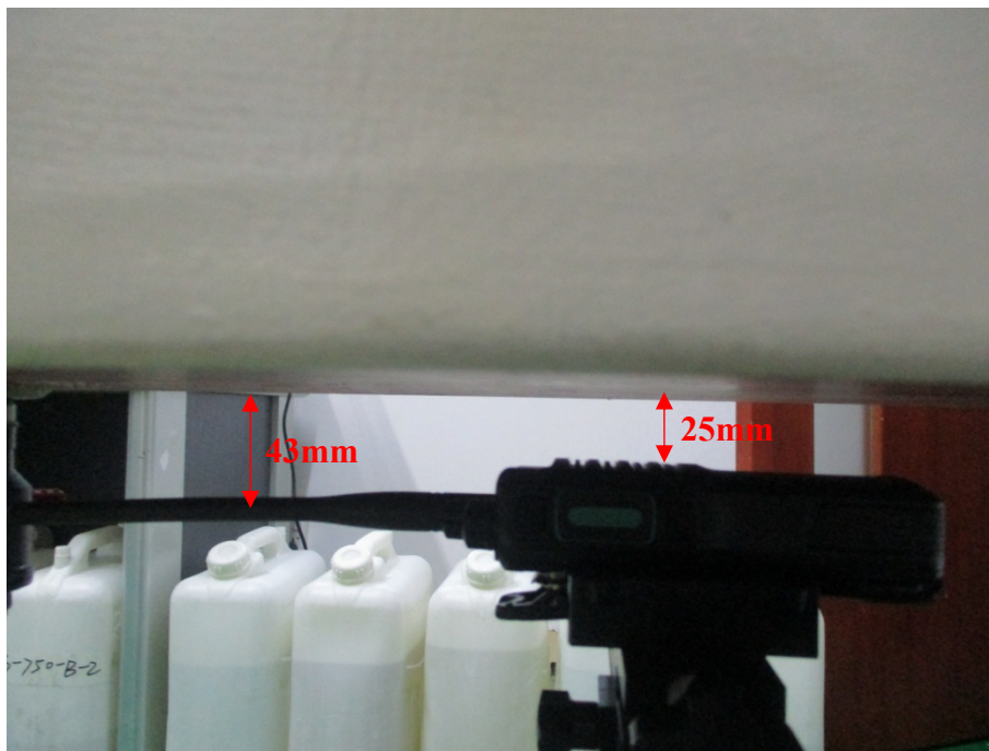
Body Worn Back Setup Photo(0mm)