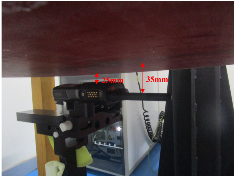
Body Worn Back Setup Photo(0mm)