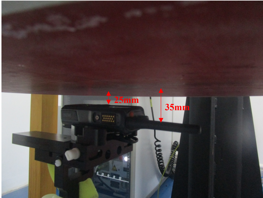
Body Worn Back Setup Photo(0mm)