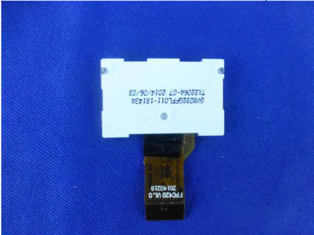
Figure 17 Component Side of the PCB