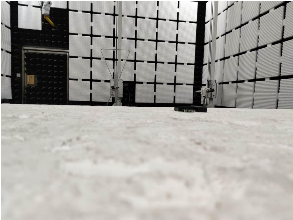
Below 1 GHz