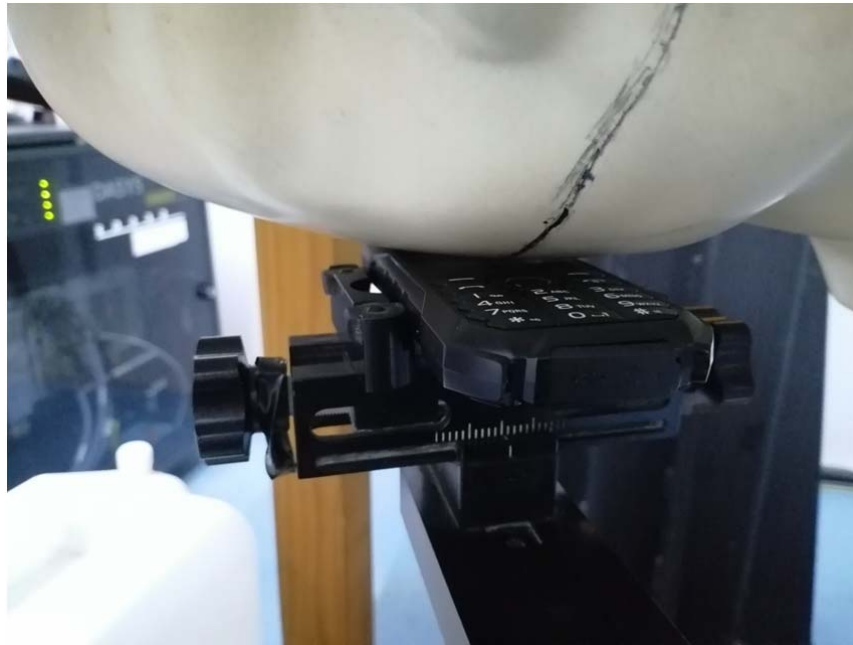
Head Right Tilt Setup Photo (0mm)