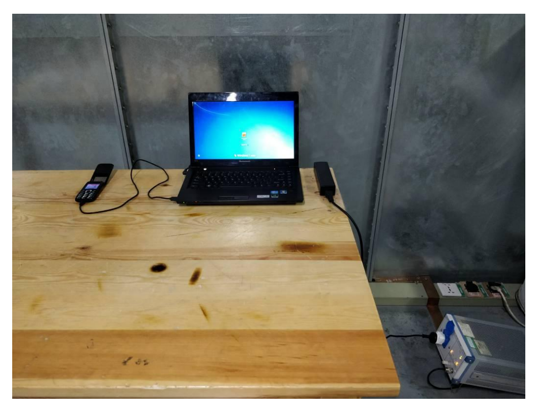
Test Setup Photo of Power Line Conducted Measurement