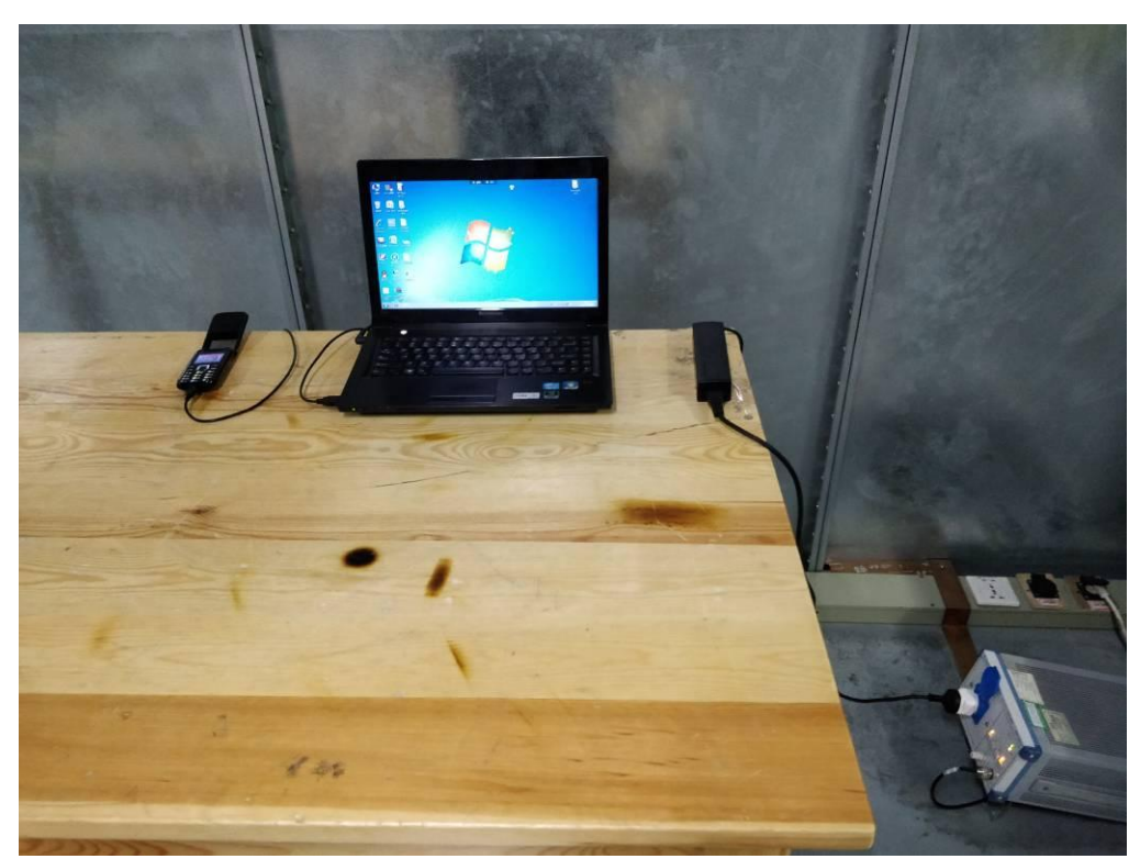
AC Conducted Emission of charge from power adapter mode

AC Conducted Emission of charge from PC mode