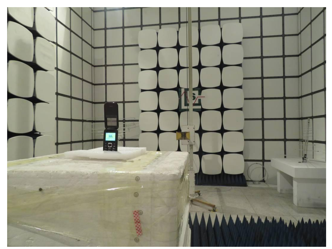
Fig. 2 (Above 1GHz)

This report shall not be reproduced except in full, without the written approval of Shenzhen LCS Compliance Testing Laboratory Ltd.. Page 1 of 2