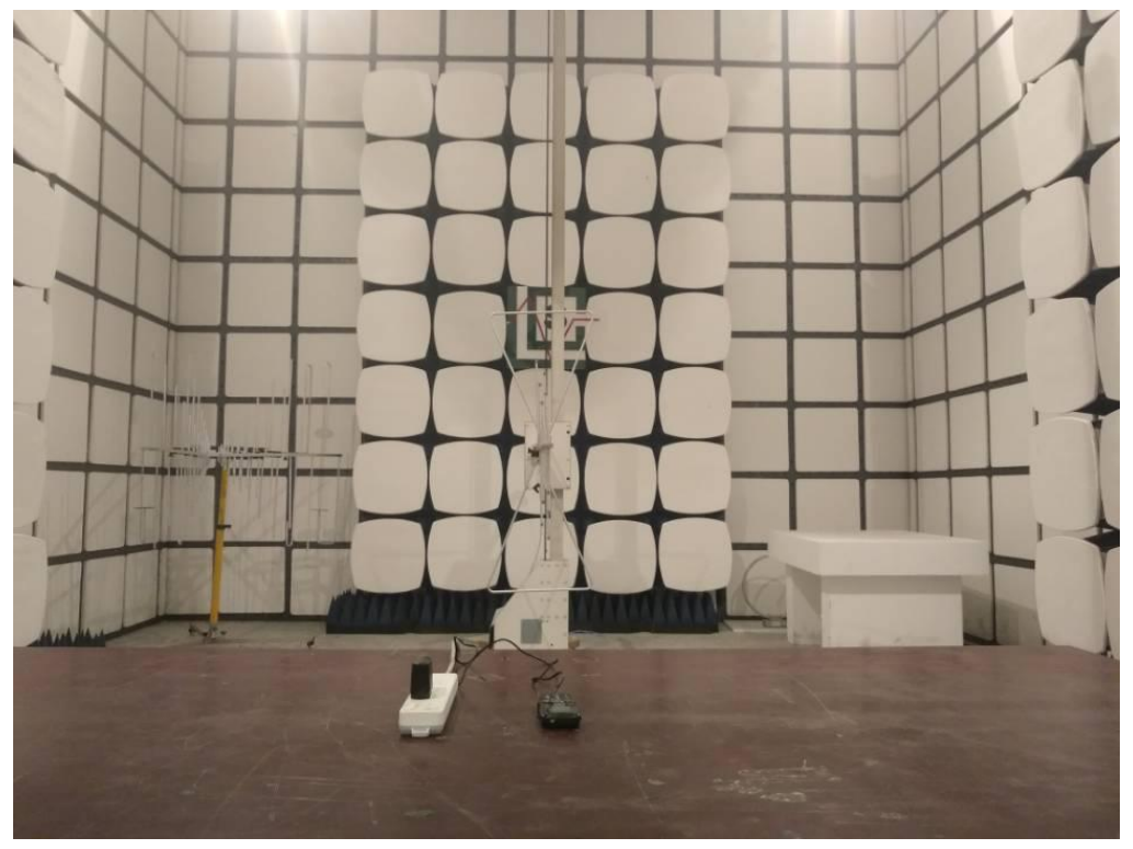
Fig. 1 (Below 1GHz)

Test Setup Photo(s) of Radiated Emissions Measurement