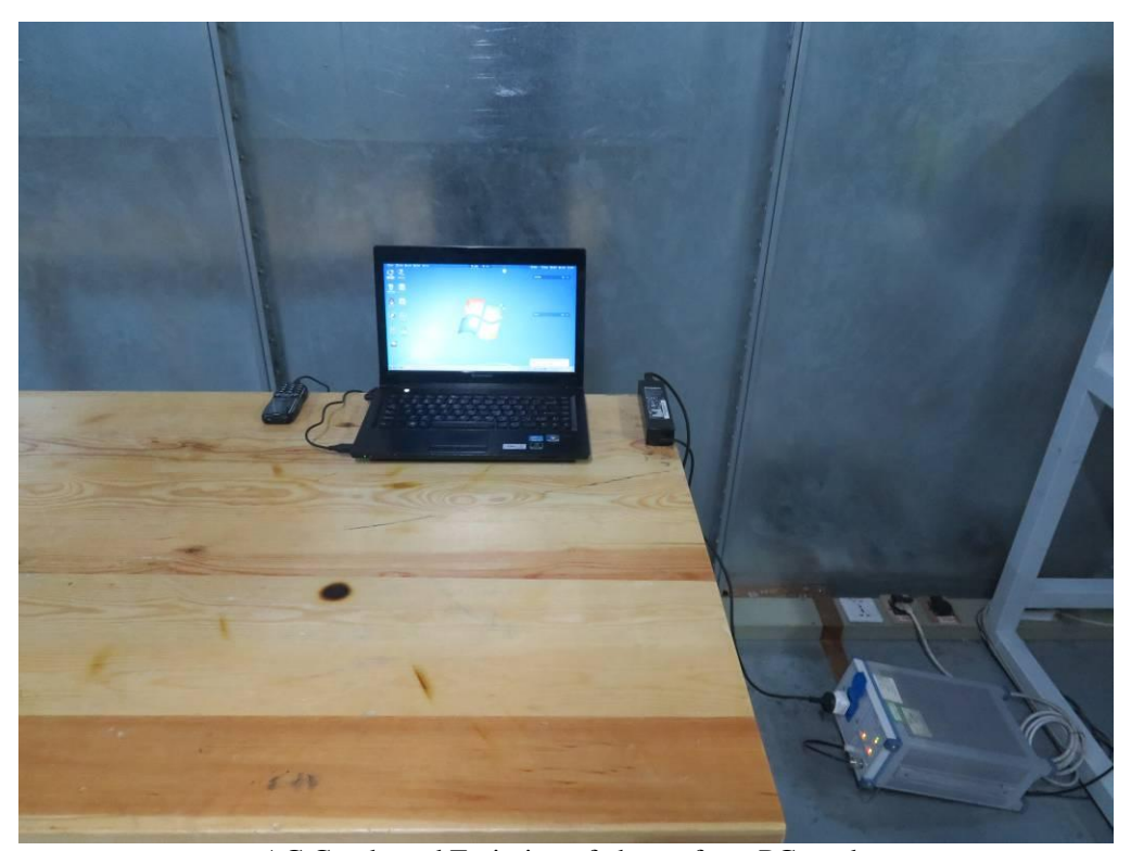
AC Conducted Emission of charge from PC mode