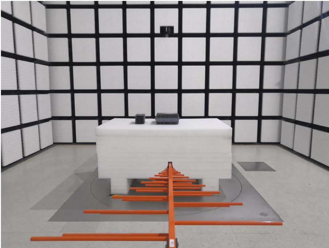
RE Below 1G DC 48V