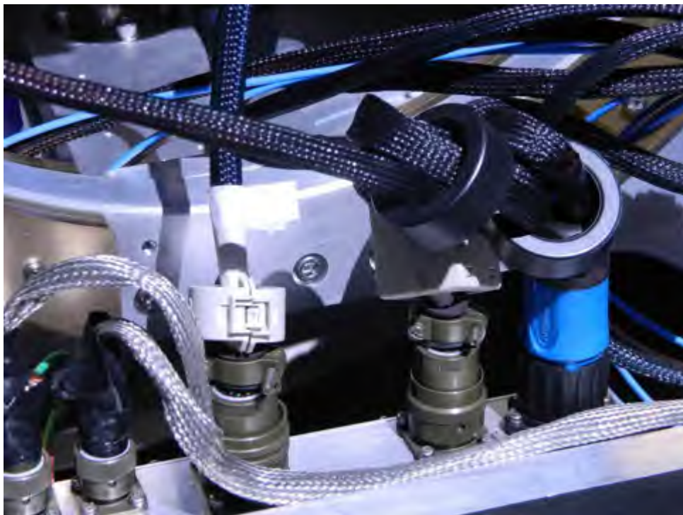
Photo 6 - Close up of ferrites on the cables, 1.2m dish

CONFIDENTIAL – NOT FOR PUBLIC DISCLOSURE