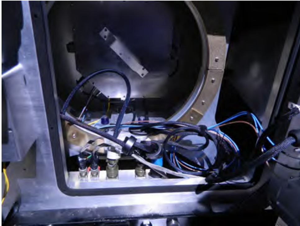
Photo 5 - EUT internal rear view, 1.2m dish