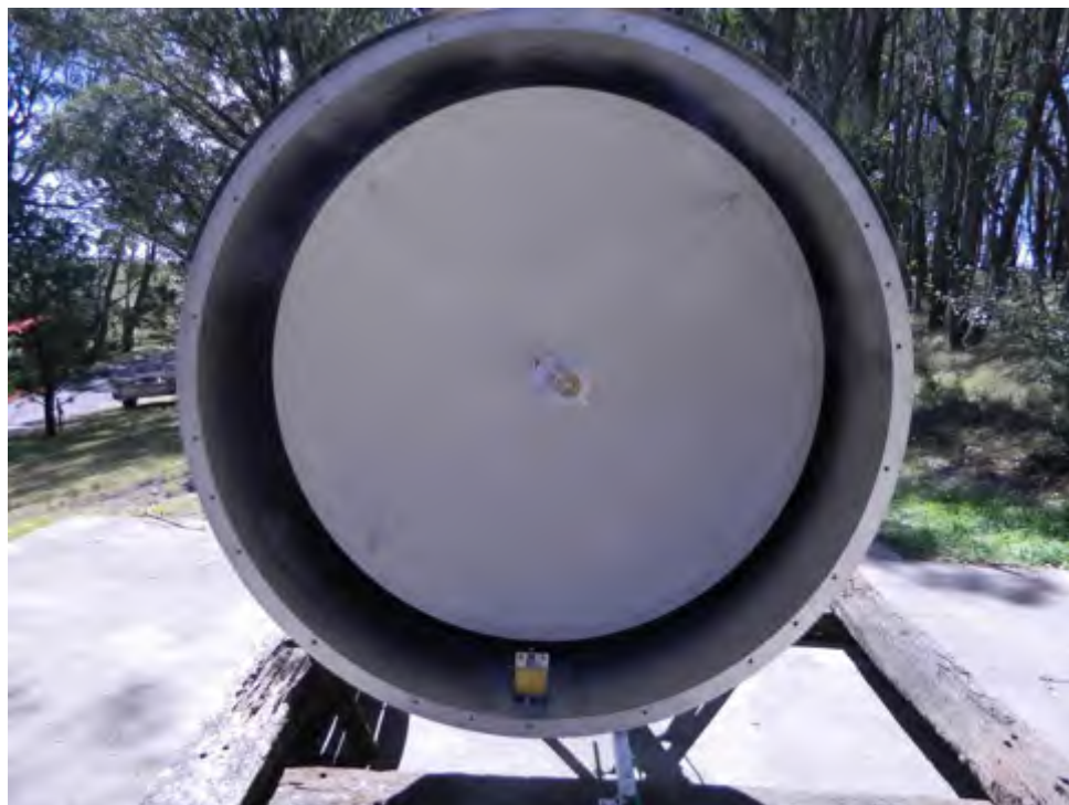
Photo 2 - Front internal view of 1.2m dish

CONFIDENTIAL – NOT FOR PUBLIC DISCLOSURE