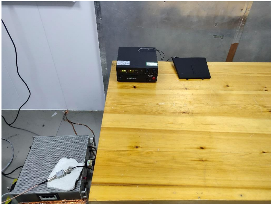
Test Photo 1