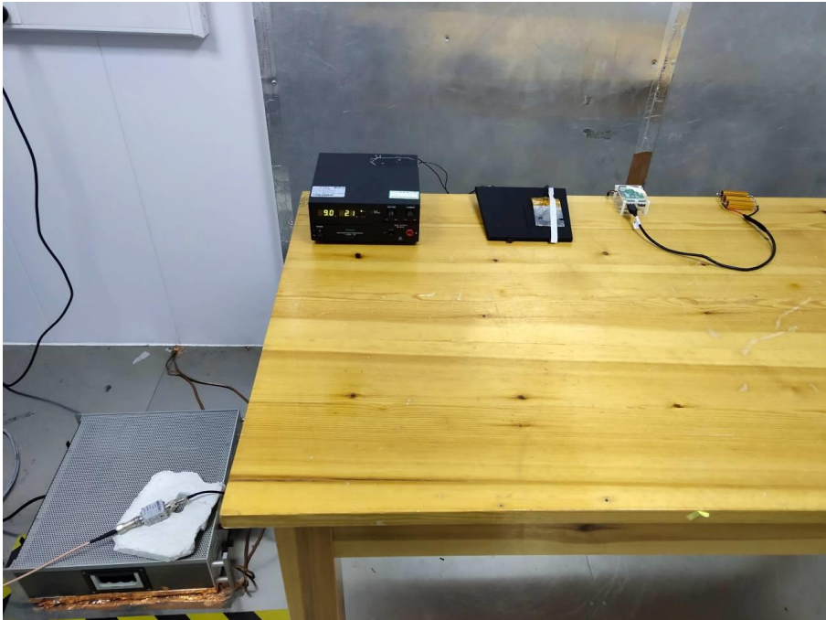
Test Photo 1