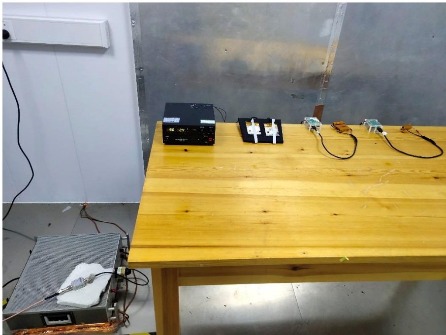
Test Photo 1