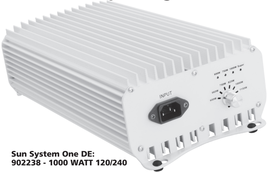
Sun System One DE: 902238 - 1000 WATT 120/240

1000 WATT DE BALLAST WITH SELF-DIAGNOSTICS