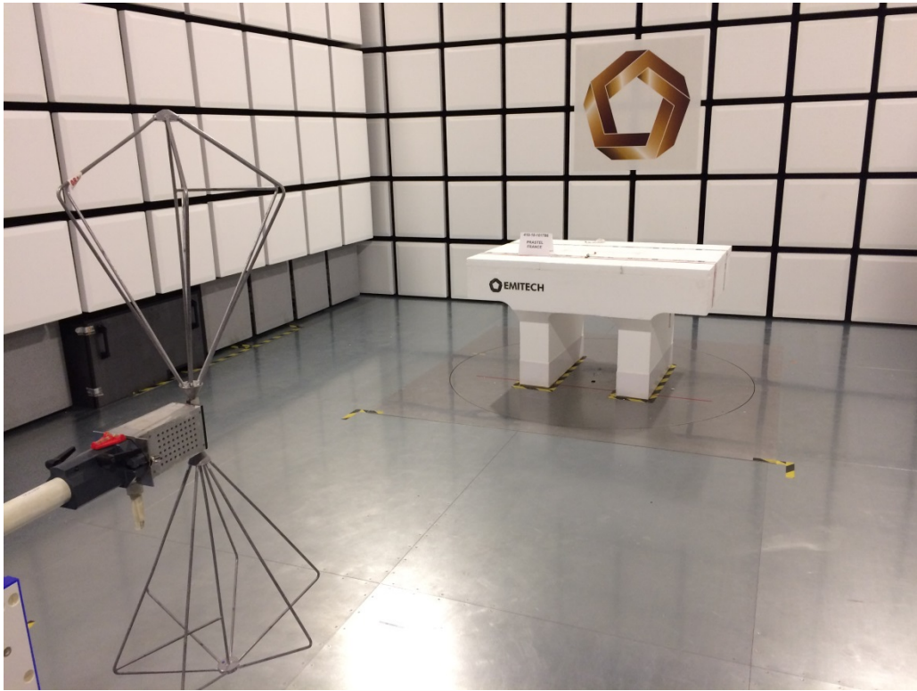
TEST SETUP PHOTO(S) -