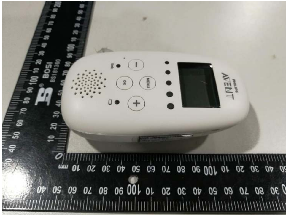
Figure 1 – Front View