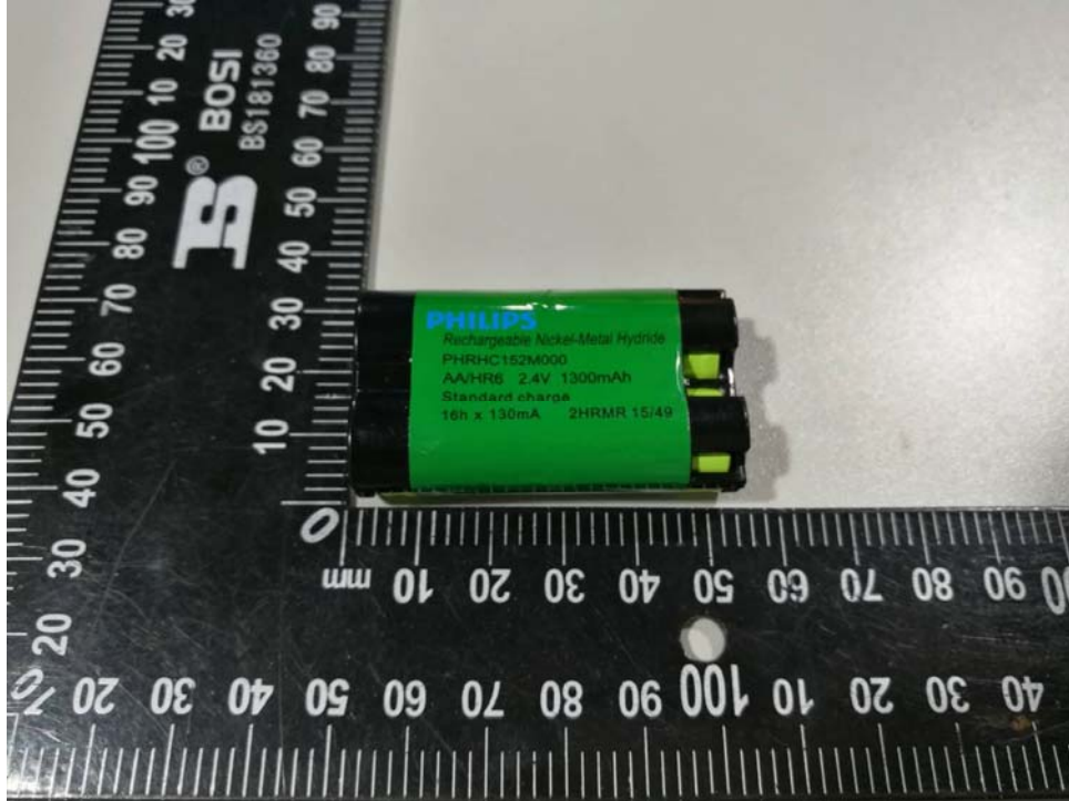
Figure 5 – 2.4VDC (1 x 2.4V 1300mAh Ni-MH rechargeable battery pack)