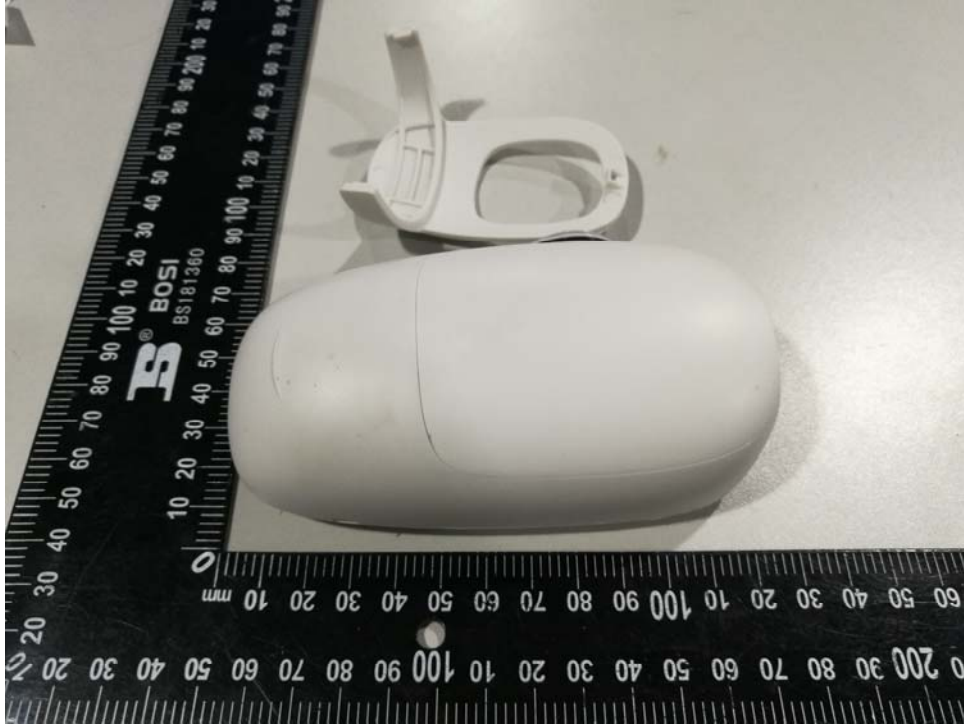
Figure 3 – Back View