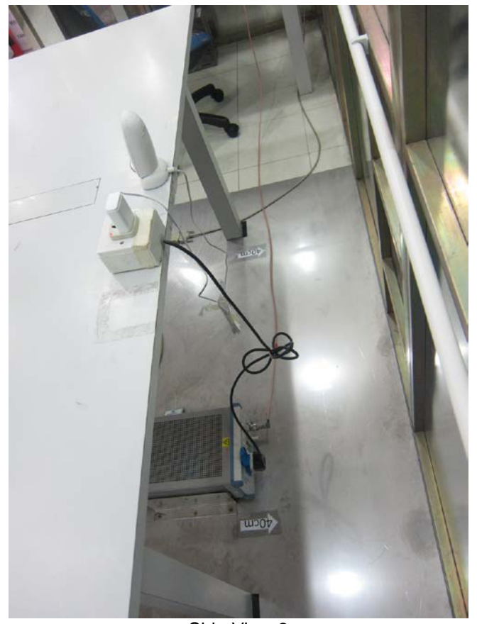
Side View 2

Test Report Number: 18071311HKG-003, 18071311HKG-004 FCC ID: 2AEFK-SCD720H