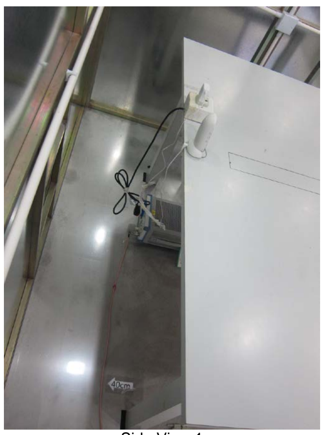
Side View 1

Test Report Number: 18071311HKG-003, 18071311HKG-004 FCC ID: 2AEFK-SCD720H