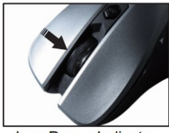
Low Power Indicator

The mouse is equipped with low power capacity indicator. When the battery power gets low during the period of use, the Low Power Capacity Indicator (under the Scroll Wheel) will flash. Please replace the battery. Note: we recommend you use AA alkaline dry cell battery which will supply longer battery life