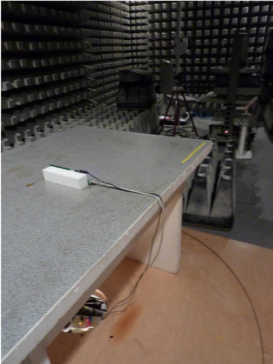
136117_03: Test setup - Radiated emission, Antennas terminated (fully anechoic chamber)