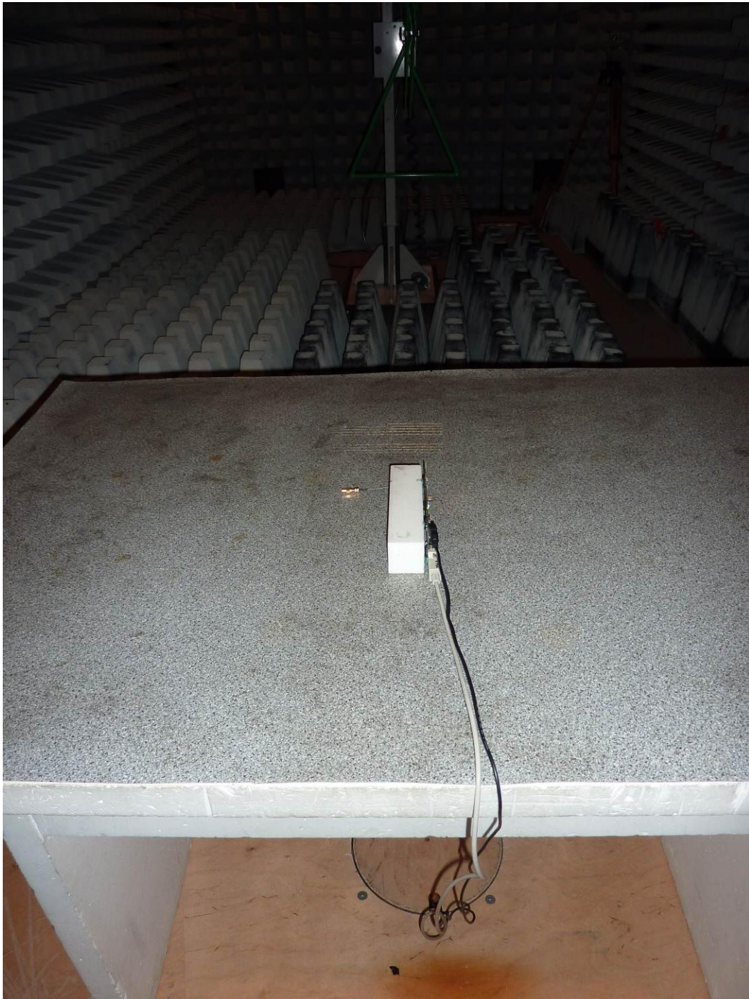
136117_01: Test setup - Radiated emission, Antennas terminated (fully anechoic chamber)