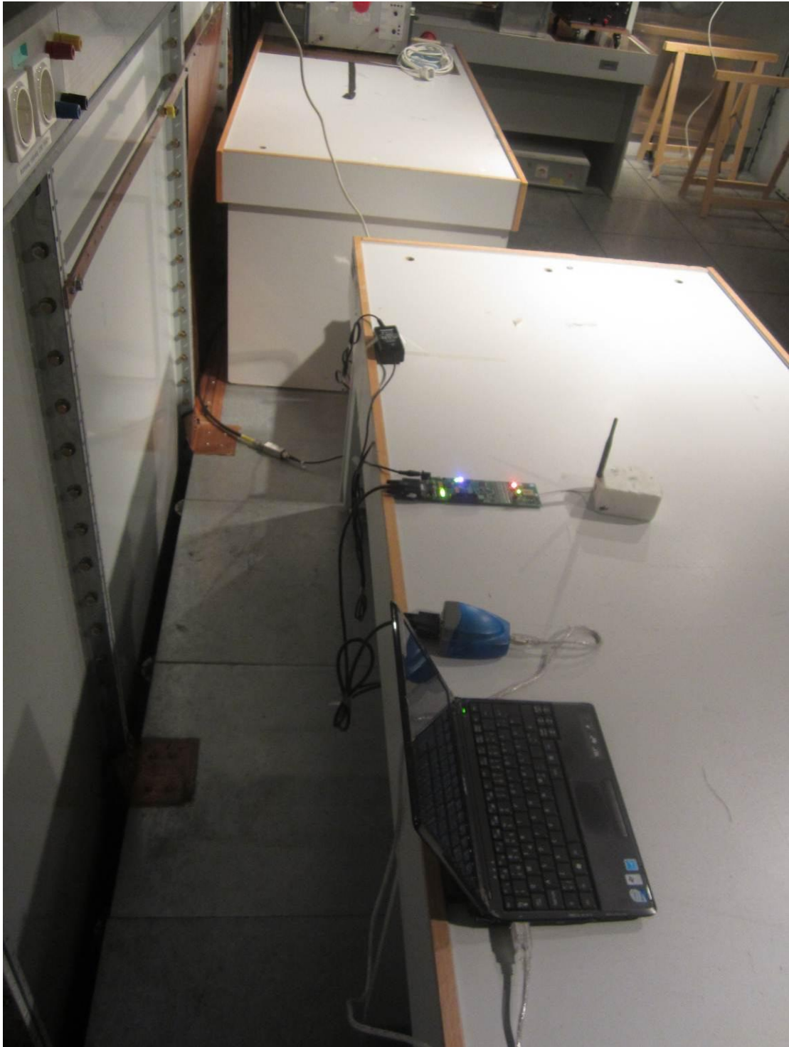
136117_04: Test setup – conducted emissions on power supply lines