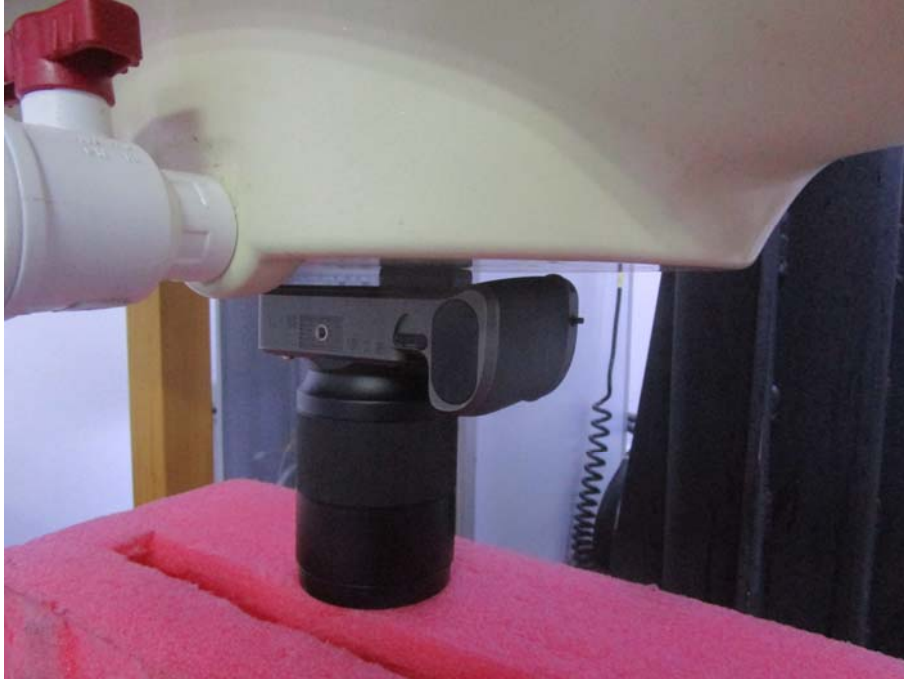
Test Position_Front (0mm)