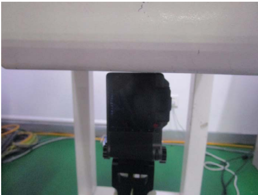
Test Position_Left (0mm)