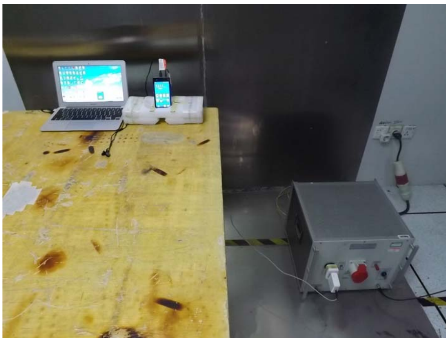
Photograph – Radiated Emission Test Setup for 30~1000MHz at Test Site 2#