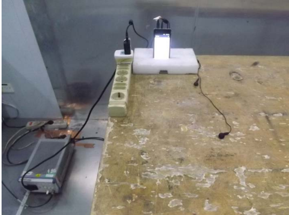
Test Site 1#