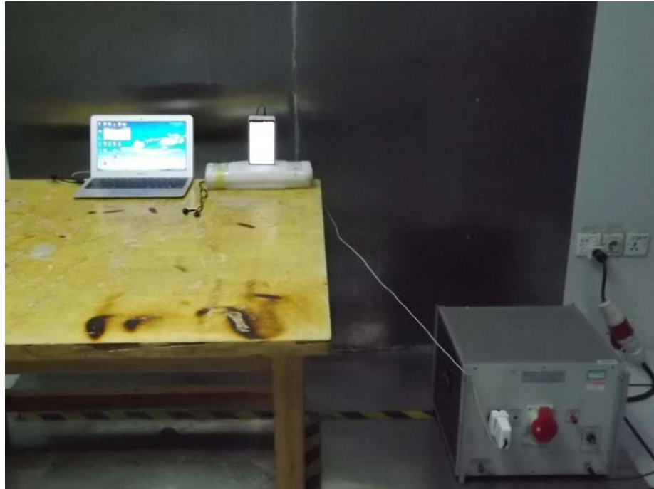
Photograph – Radiated Emission Test Setup for 30~1000MHz at Test Site 2#