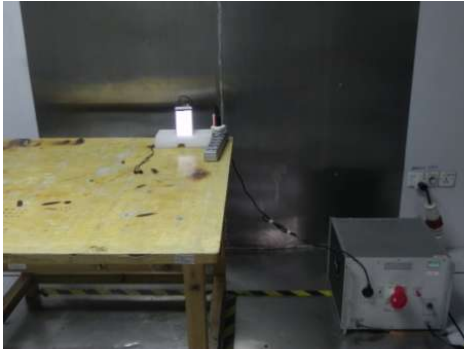
Photograph – Radiation Spurious Emission Test Setup