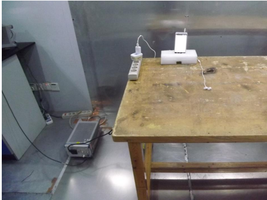
Test Site 1#

Photograph - Spurious Emissions Radiated Test Setup