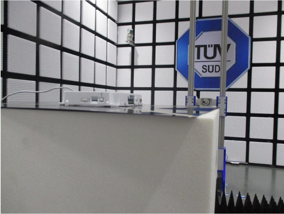
DFS(slave) setup photo