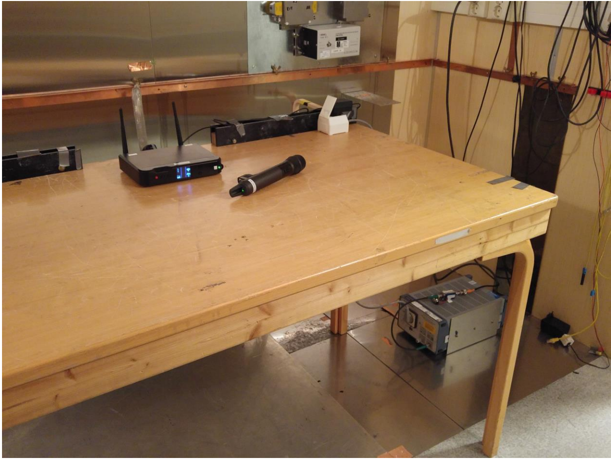
Power line Conducted Emissions Test