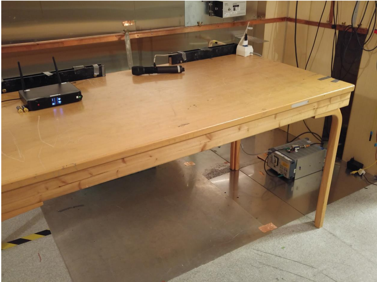
Power line Conducted Emissions Test