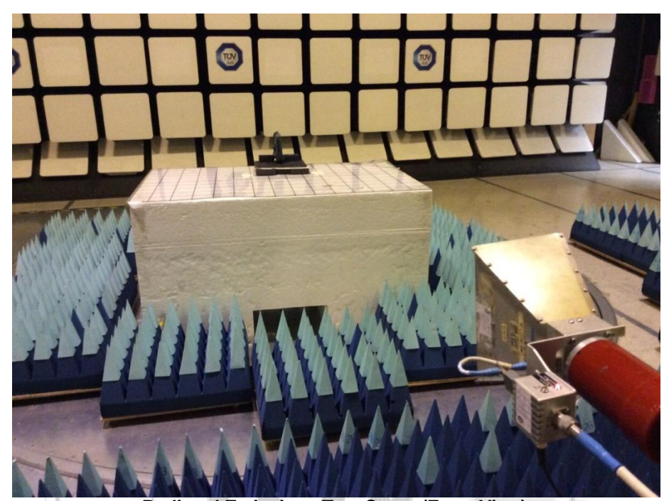
Radiated Emissions Test Setup (Front View)