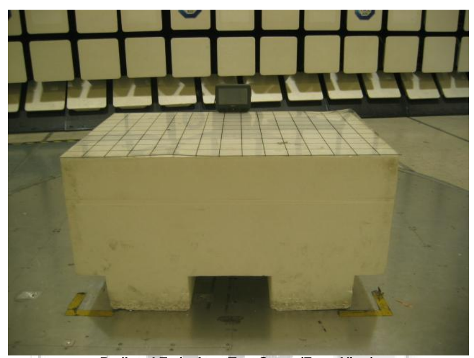
Radiated Emissions Test Setup (Front View)