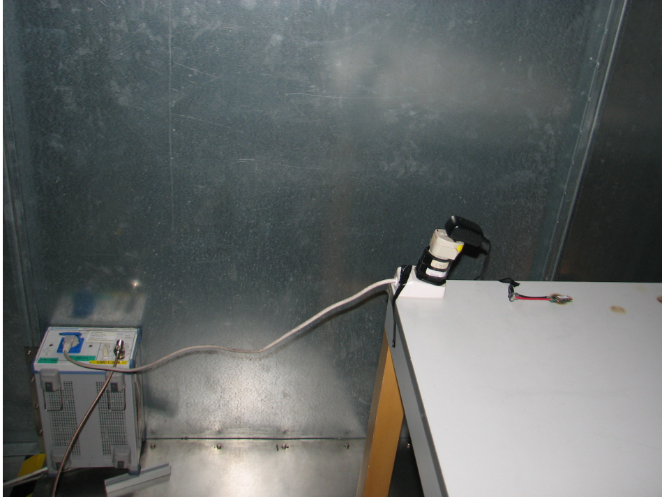
Setup for Disturbance voltage on AC mains